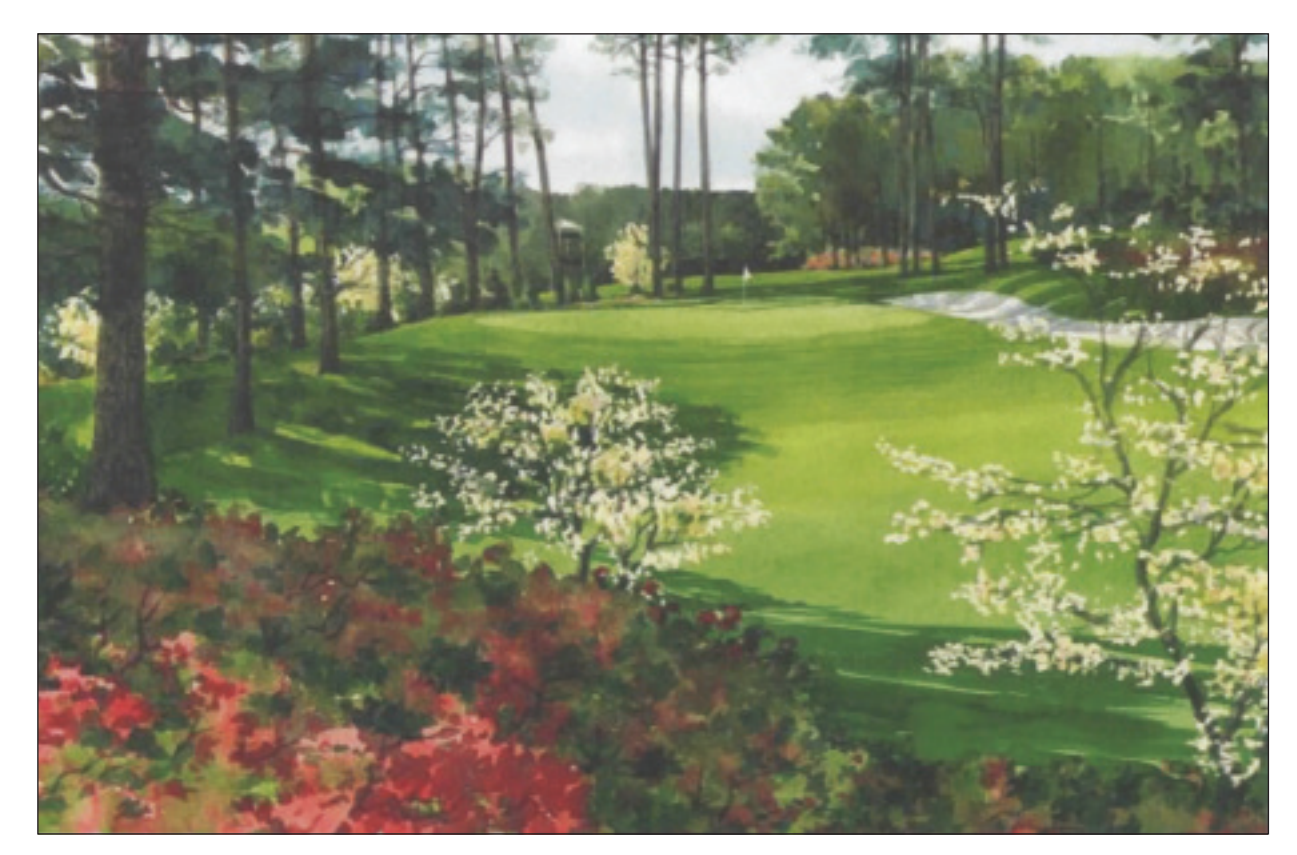
Augusta National GC, Nos. 10

Many courses aspire to achieve its look and feel, but there are none like Augusta National GC. We all, including professional players, fans, media producers, advertisers, and writers have made comments at one time or another about beauty of a golf scene; however, none more serious have been made that praise the beauty of an entire course, the Augusta National GC.