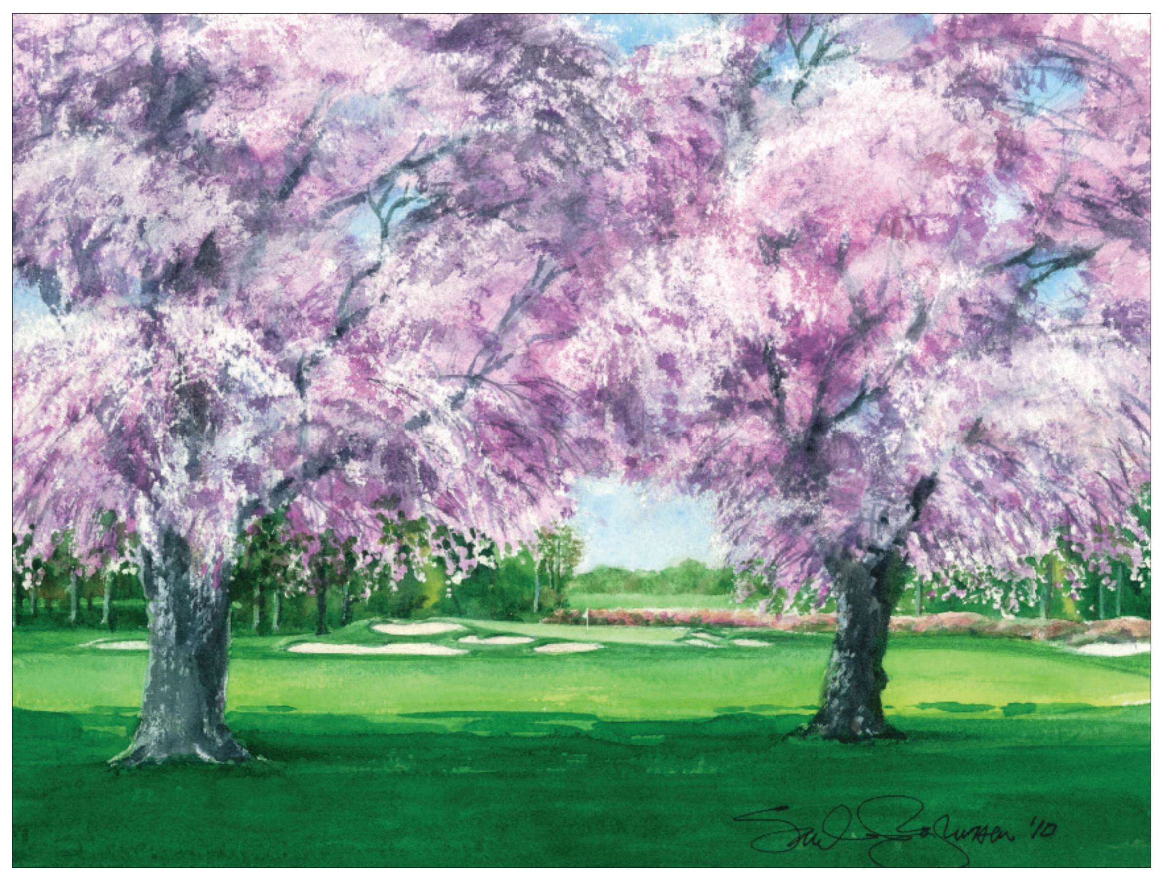
Hollywood GC, No. 13