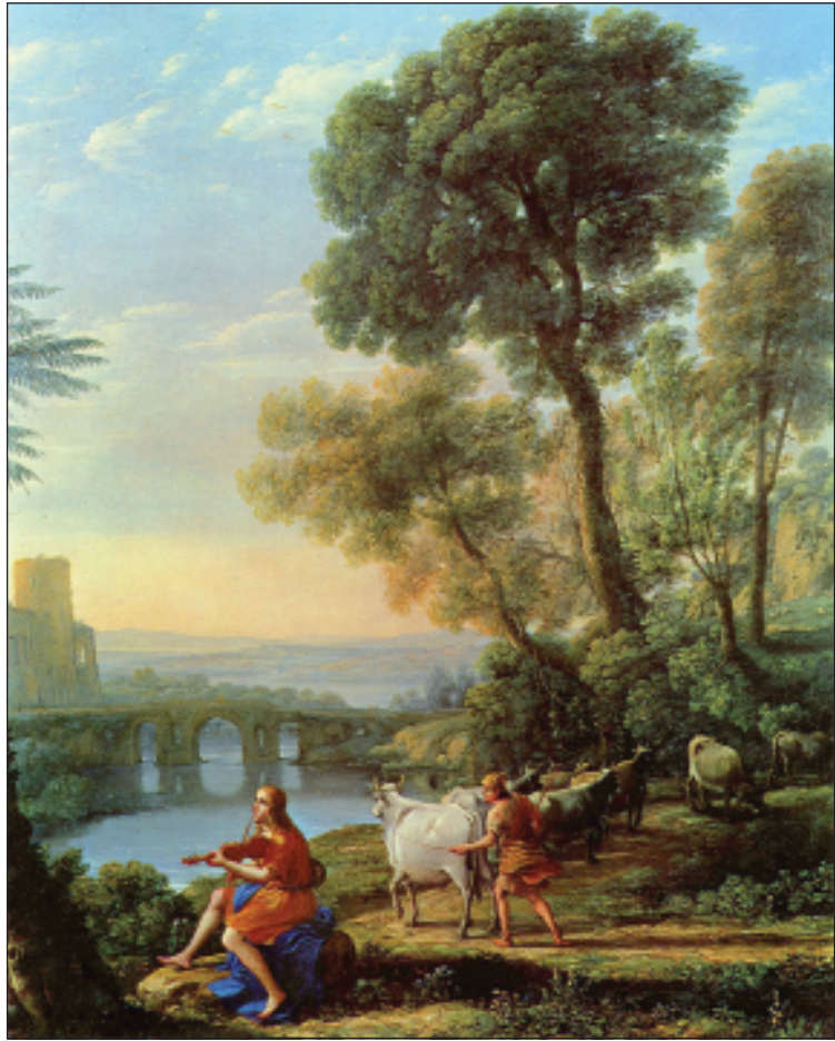
Apollo and Mercury, 1645 by Claude Lorraine

In addition to the curved line and scientific advancements in landscape gardening, possibly the greatest contribution to golf was the development of grasses, the most important landscape element of a golf course. Closely shorn grasses first emerged in 17th-century England. Seed from Northern Europe found ideal growing conditions in England and over time was