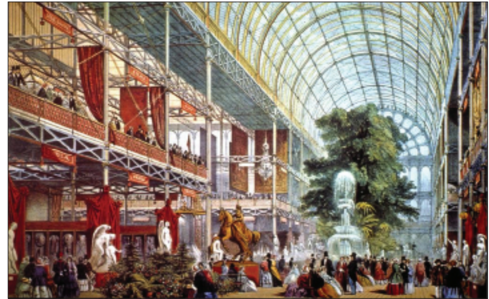
The Great Exhibition, 1851, The Crystal Palace

gested by influential golf commentators, aesthetes, and writers. These aesthetes were the likes of Hutchinson, Simpson, Colt, MacKenzie, and Wethered and others who drilled down into the subject convincing readers that their golf courses need not be dismal, dull, or ugly.