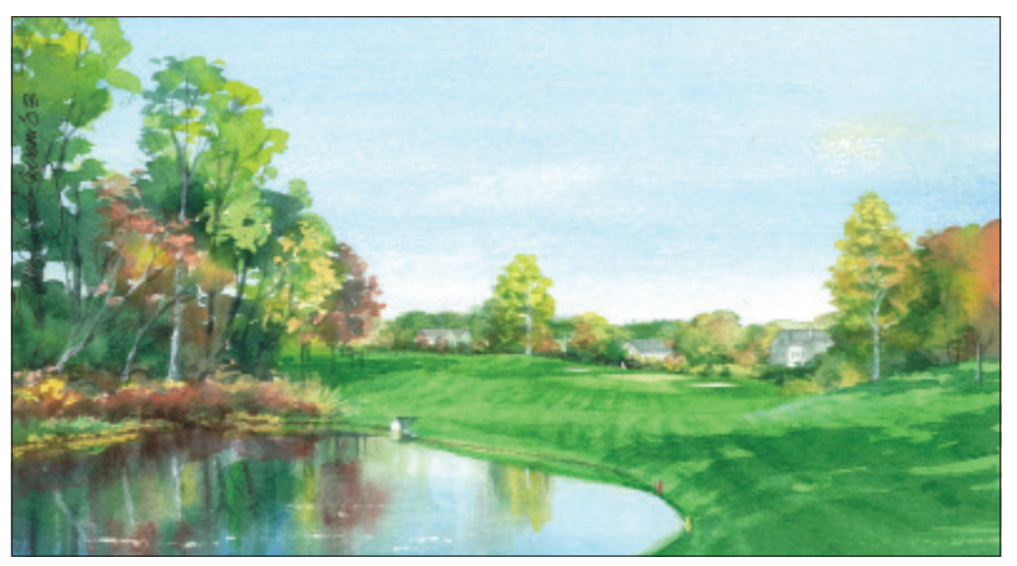
The Lakes Club, No. 4

Examples of water components, left, are compared. Osprey Point GL, No. 11 water component is a landscape effect; it provides no recovery play for a slightly miss-hit shot. The Lakes Club, No. 4 water component is not considered a landscape effect because the water is functional and does not come into play. At No. 4 the tees are to the right of the pond and the long tee at the back edge. With a little design imagination Osprey Point No. 11 could be just as beautiful, more fun to play and enjoyed by many more core players.