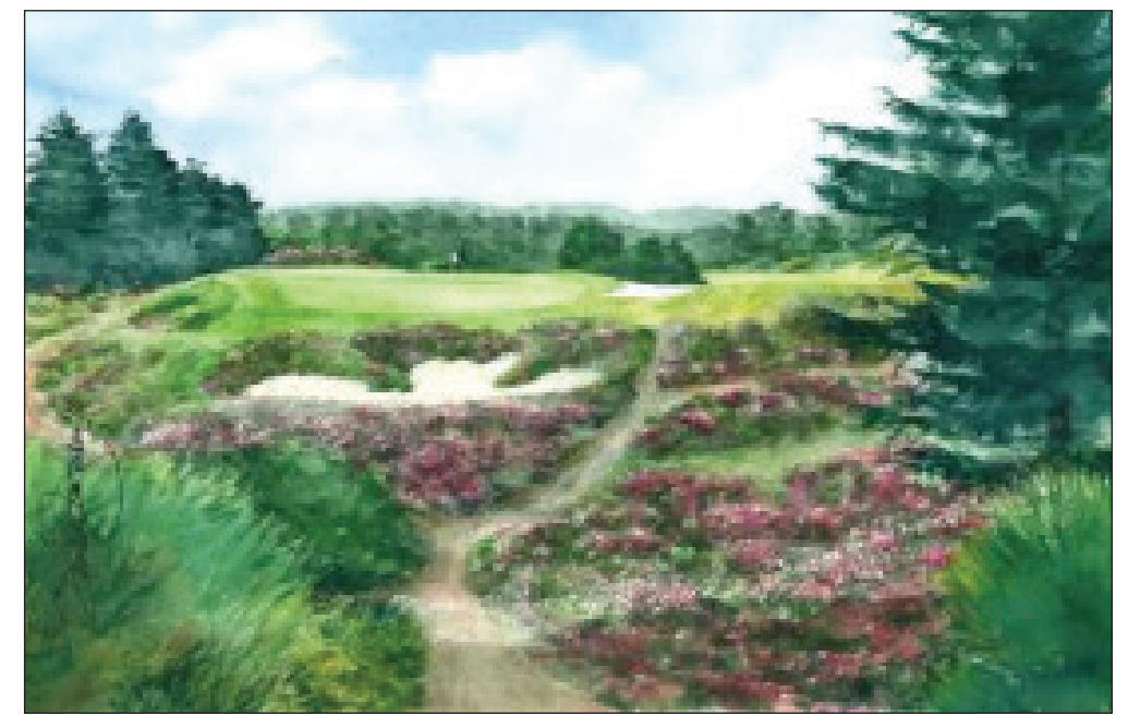
Painting 2010 - 5th Hole, Sunningdale GC, New Crs., Berkshire, England

Another landscape component, rough/margins, typical of paintings from the book that depict landscape effect is shown below. Compare the images of rough/margins of one of Britain's most famous courses built in 1923. The images show heather in the foreground of.